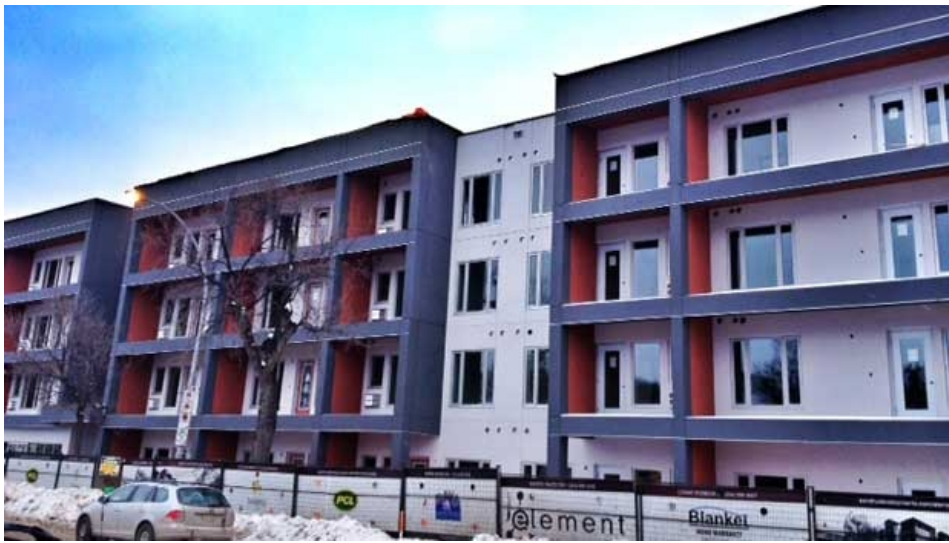
The orange tarps have come off The Element Condominiums on Sherbrook Street and Sara Avenue in Winnipeg's West Broadway neighbourhood this week.

CBC News Posted: Jan 30, 2013 11:19 AM CT | Last Updated: Jan 30, 2013 2:27 PM CT