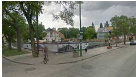
What the site of the condominium building looked like before construction began.

Leah McCormick, executive director of the West Broadway BIZ, says neighbours have been posting comments about the new building now that it has been revealed.